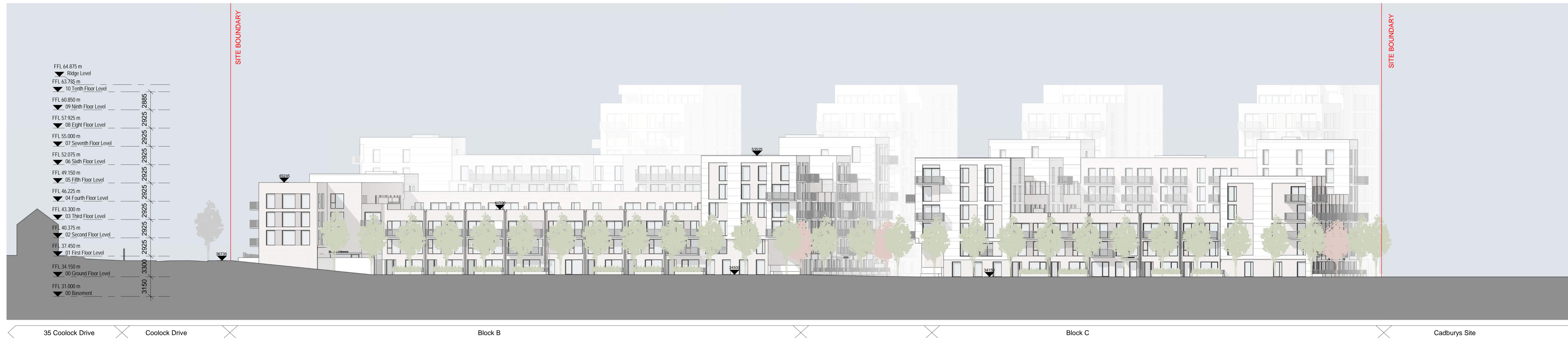
2 Elevation SW 1 : 250