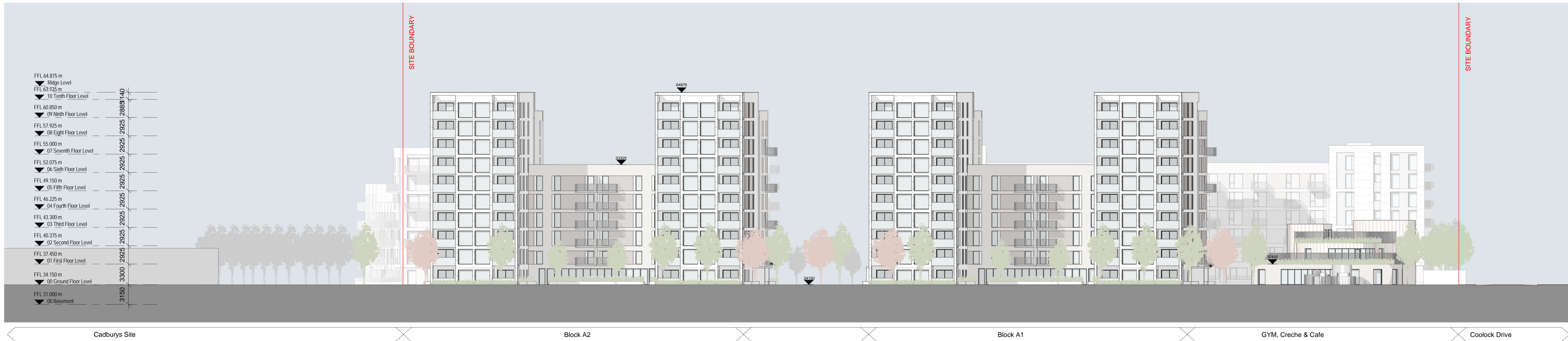
1 Elevation NE 1 : 250